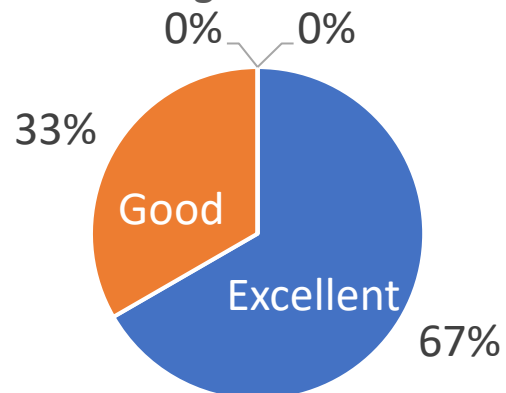
What is your overall evaluation of Peering Asia 2021v?