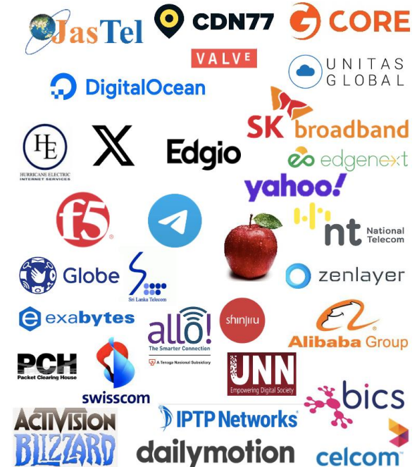
Overview of select DE-CIX ASEAN member networks which are not yet based in Jakarta