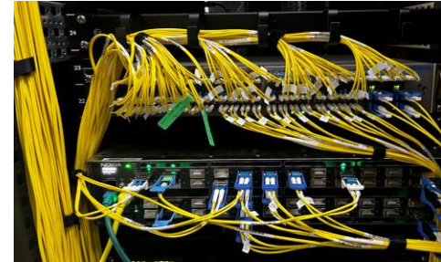
Production 60 x 1/10GE Ports on Nokia Satellites