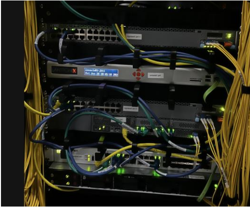
Management Network / OOB