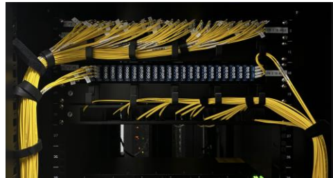
Passive Patching, Riser & MMR precabing